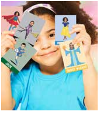
Custom & Personalised books, card games, colouring activites and more...