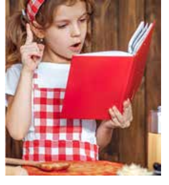
We make reading and writing fun. We embrace creativity. It's fun. It's unique. It's Saronti!

Need another copy of this book? Go to <a href="https://www.saronti.com/storymakers">https://www.saronti.com/storymakers</a> Your Book reference is Sar2612